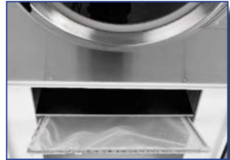
Extra Large Lint Capacity

Dexter reserves the right to change features or specifications without notice.