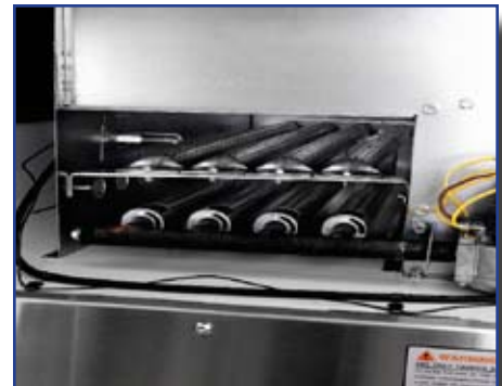
Efficient Burner Design