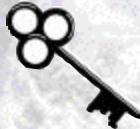
DVTM Key Card