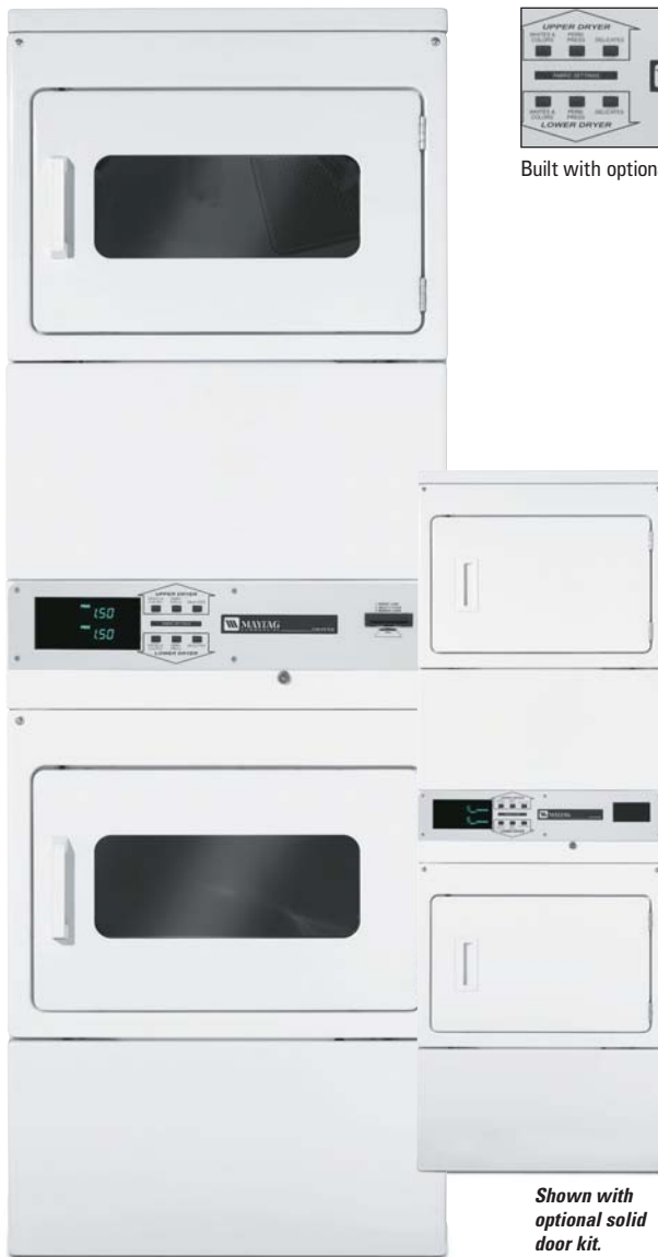
Built with optional non-metered design.

Maximizing your equipment investment for over a half century.